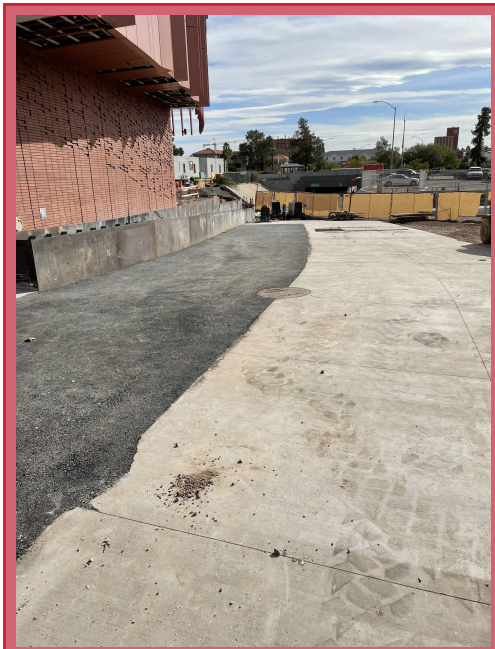
View of the corridor facing South

Fun Fact: Landscape and paving has started for the North side of the Highland Underpass Corridor. The NEW path will open early morning January 11th!