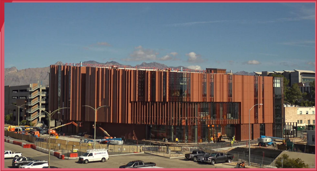
Facing North View