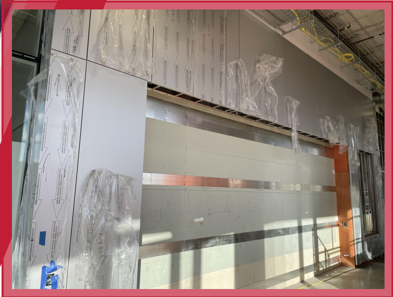
Metal wall panel in the South lobby space on level 1