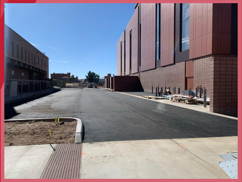
View facing South of paved asphalt

This section of asphalt is a huge milestone! The east yard of the ARB project is nearly complete, and is only awaiting striping for the parking stalls.