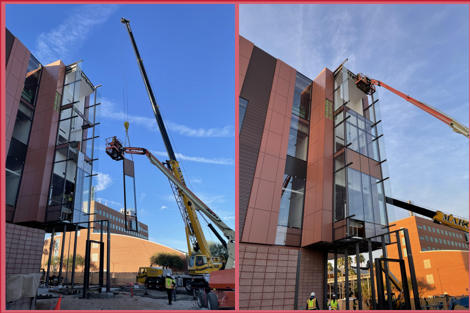
Flying panels of glass for the NW elevation

The last piece of glass for full enclosure!