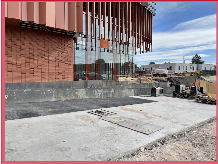
Planter steel facing Southeast

The exterior Southwest corner is a 3-tier landscape system that features raw steel for a rustic look that is consistent around the entire exterior of the Applied Research Building.