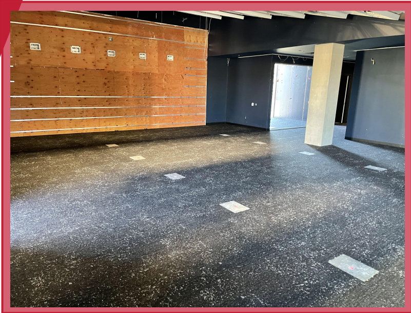
Carpet installed in the Mission Operations space on level 2