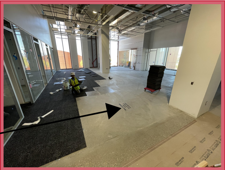
Crew installing carpet in the Northwest space of level 2

The Northwest corner of the building is post-tension slab, which means that there is steel that was pulled in tension AFTER the concrete was poured. This increases strength of the slab and is engineered to support the slab where there is no load bearing columns or beams. For this reason, there are specific precautions in place to prevent future renovations from compromising the integrity of the concrete. This stamp warns against drilling, cutting, and coring for future construction!