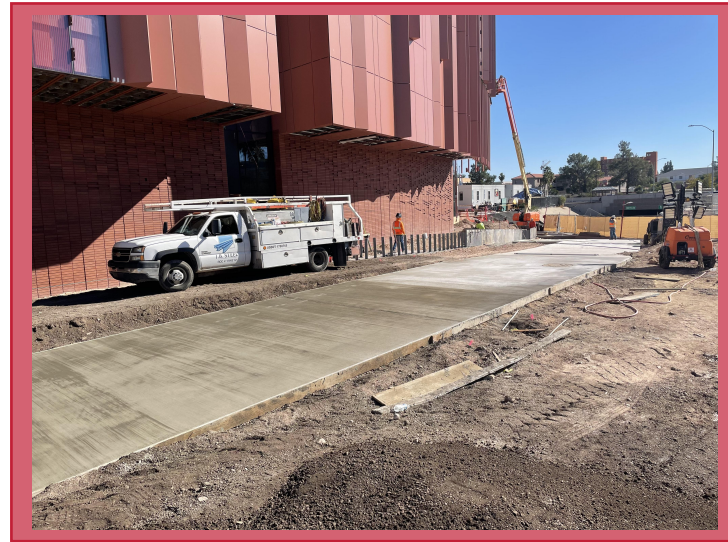
Freshly poured concrete for the North side of Highland Corridor