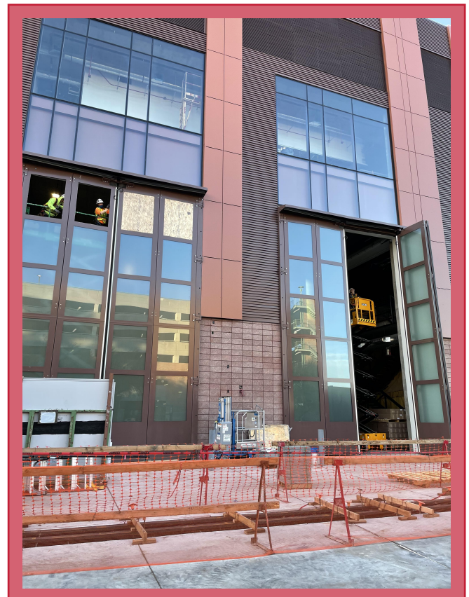
Exterior view of the bi-fold doors facing South

Fun Fact: These 30' tall doors will be motor operated, and allows for large pieces of equipment to be loaded into the High Bay Lab.