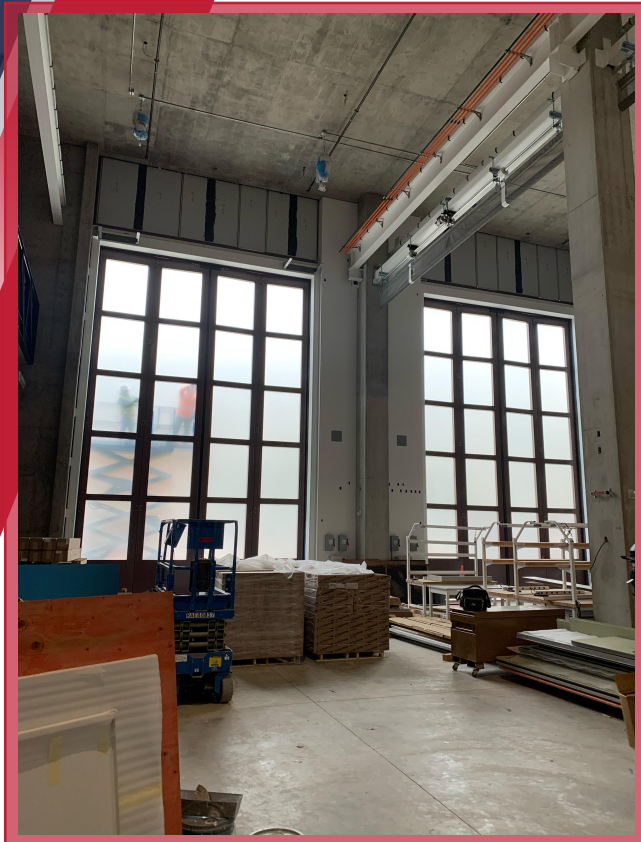
Interior view of the bi-fold doors from the High Bay Lab