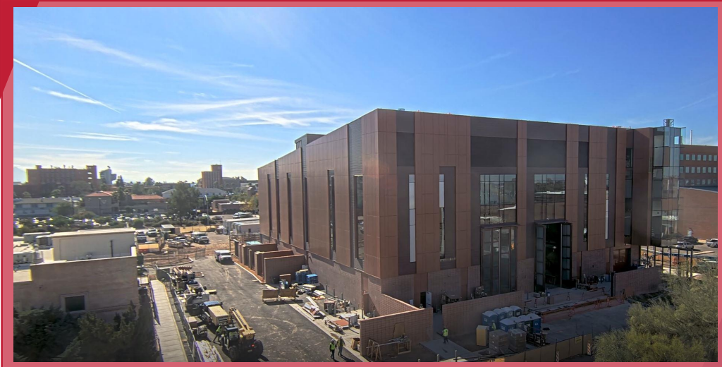
Facing South View