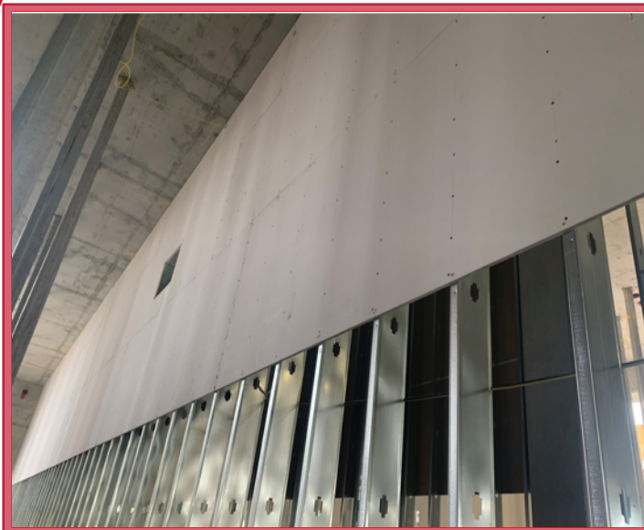
Rated Walls Sheeting