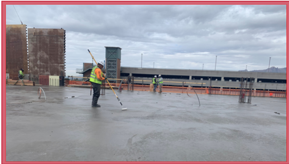
Level 3 North Slab Curing