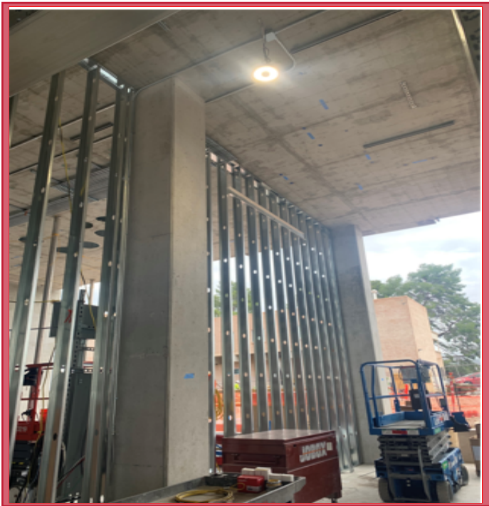
Building Temporary Lighting