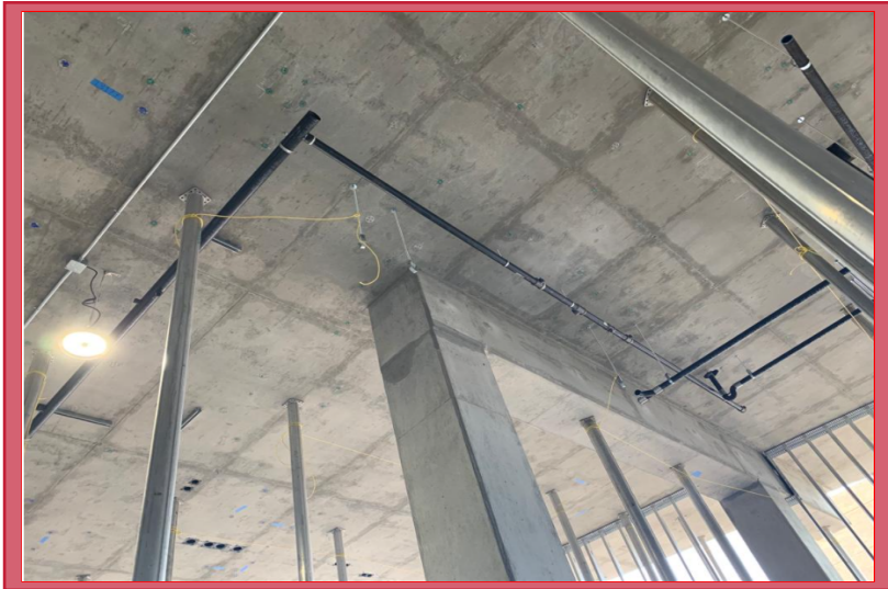
Level 1 Overhead Plumbing

PHASE: Mechanical, Electrical & Plumbing