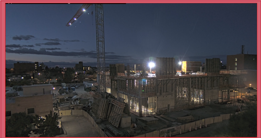
Facing South View