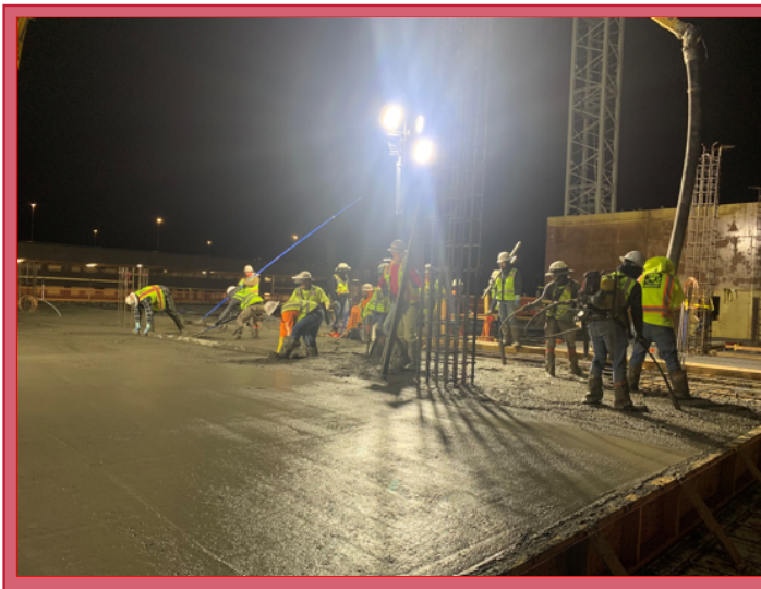
Level 3 North Slab Finishing