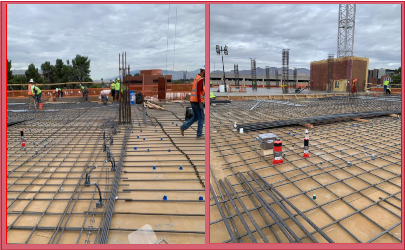
Level 3 South In Slab Rough-in

PHASE: Mechanical, Electrical & Plumbing