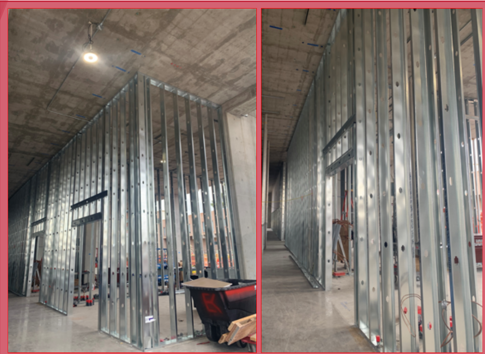
Rated Walls Framing