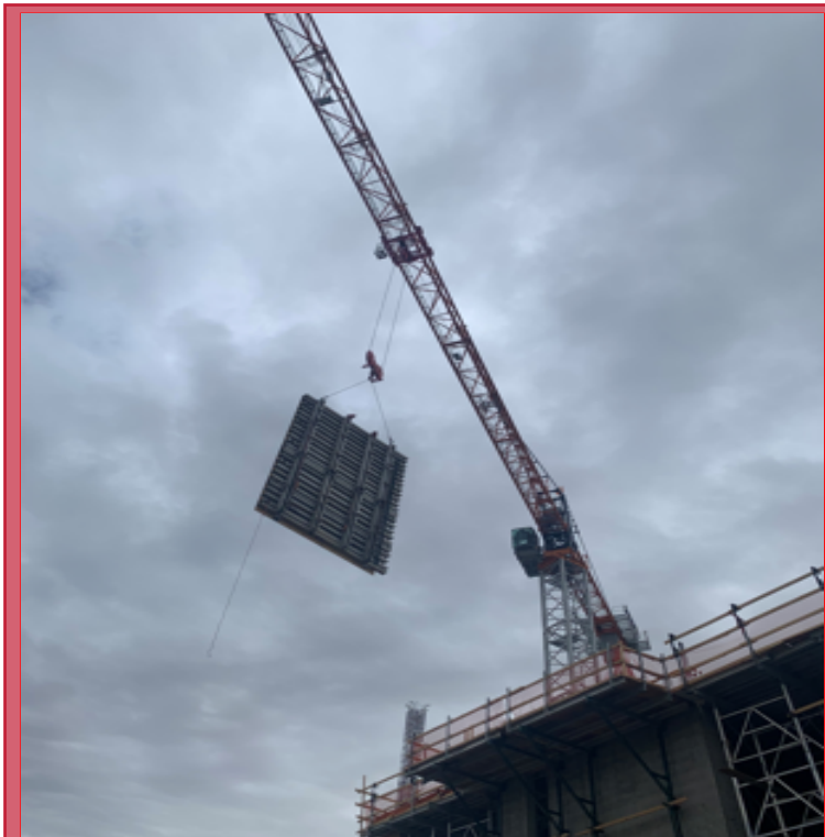
Setting Level 3 Wall Formwork