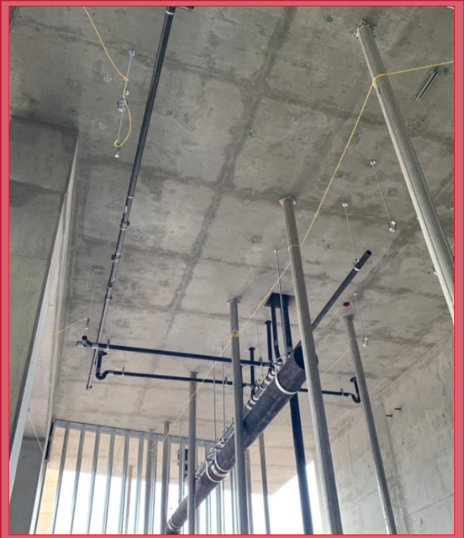
Level 1 Overhead Plumbing