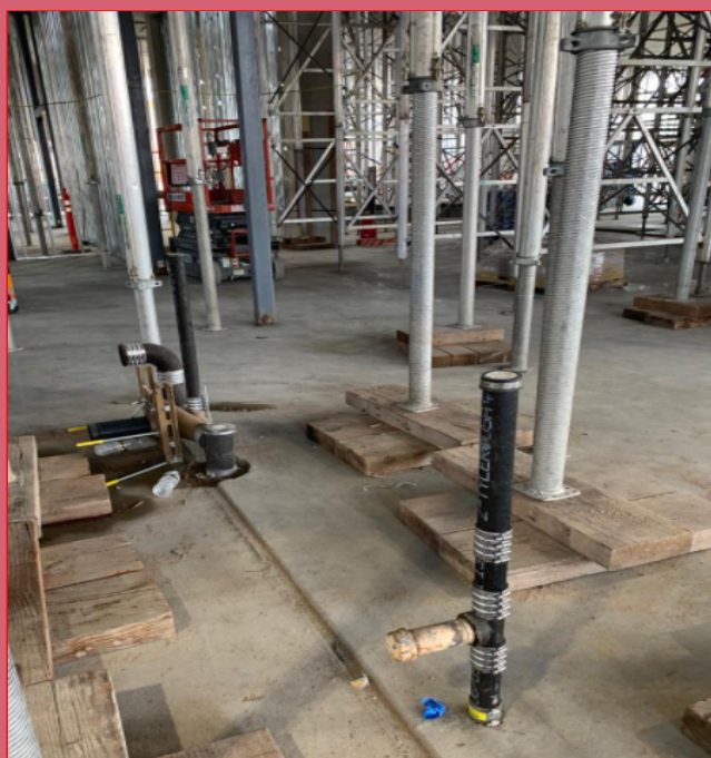
Level-1 Restroom Plumbing