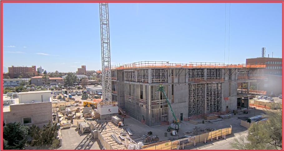
Facing South View