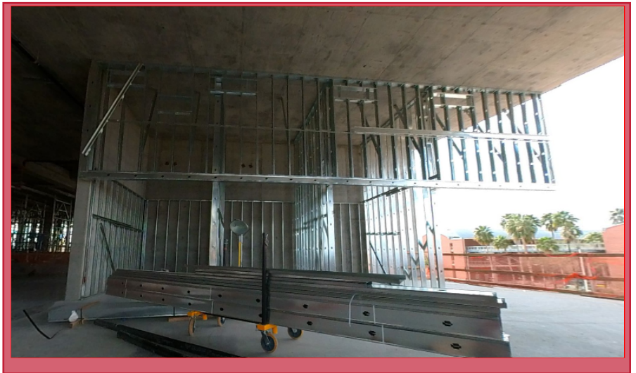
Level-2 Interior Walls Framing