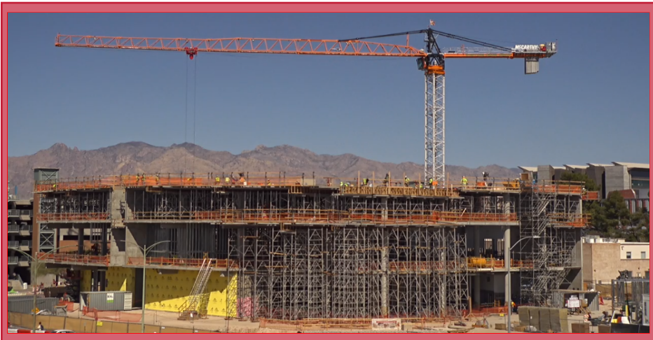
Facing North View