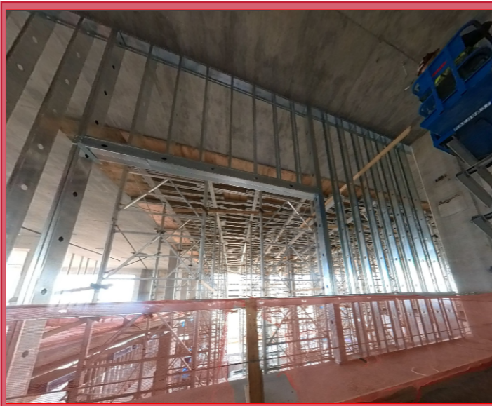
Level-2 High-bay Interior Framing