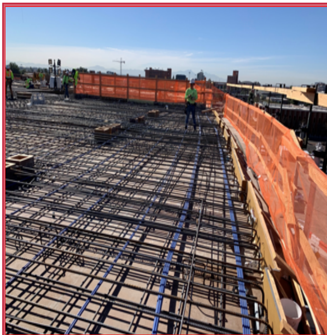
Level-4 MEP Blockout