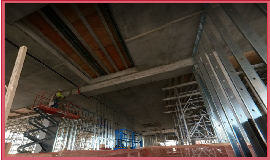
Level 3 Ceiling Patching