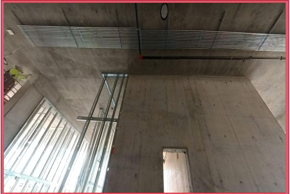
Level 2 Overhead Electrical and Sprinkler Lines

PHASE: Mechanical, Electrical & Plumbing