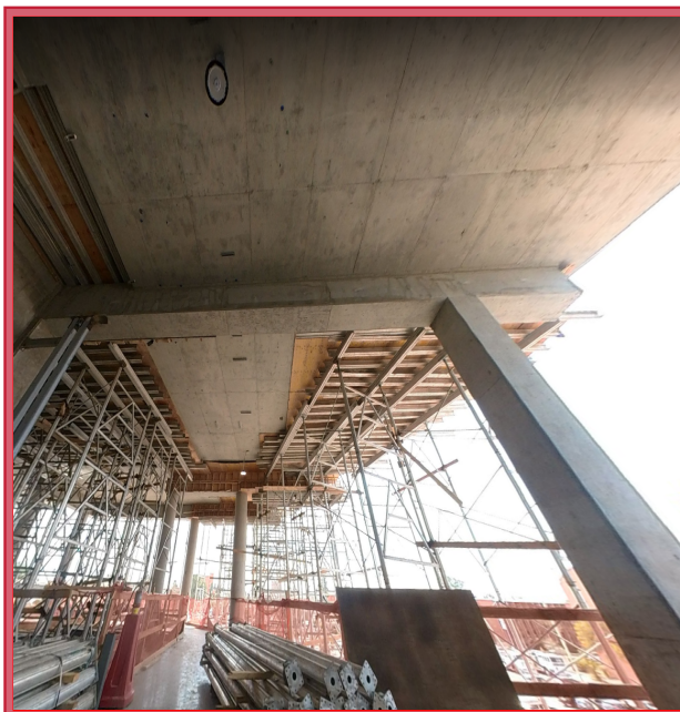
Level 4 Deck Stripping