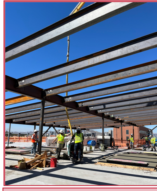
Level 4 - Pouring Equipment Pads

A flexible hose attachment is fastened to the end of the concrete pump which allows the pump to service the concrete finishing crews under the completed structural steel penthouse. In order to provide concrete to areas that aren't accessible by the pump (ex. Levels 1-3), a Georgia Buggy, a motorized concrete transport vehicle delivers the concrete safely throughout the building. They even fit through door frames!