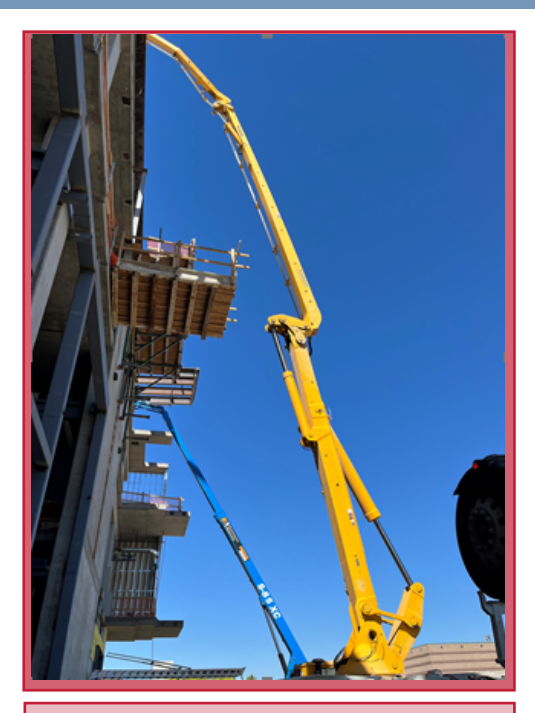
Concrete Pump Truck