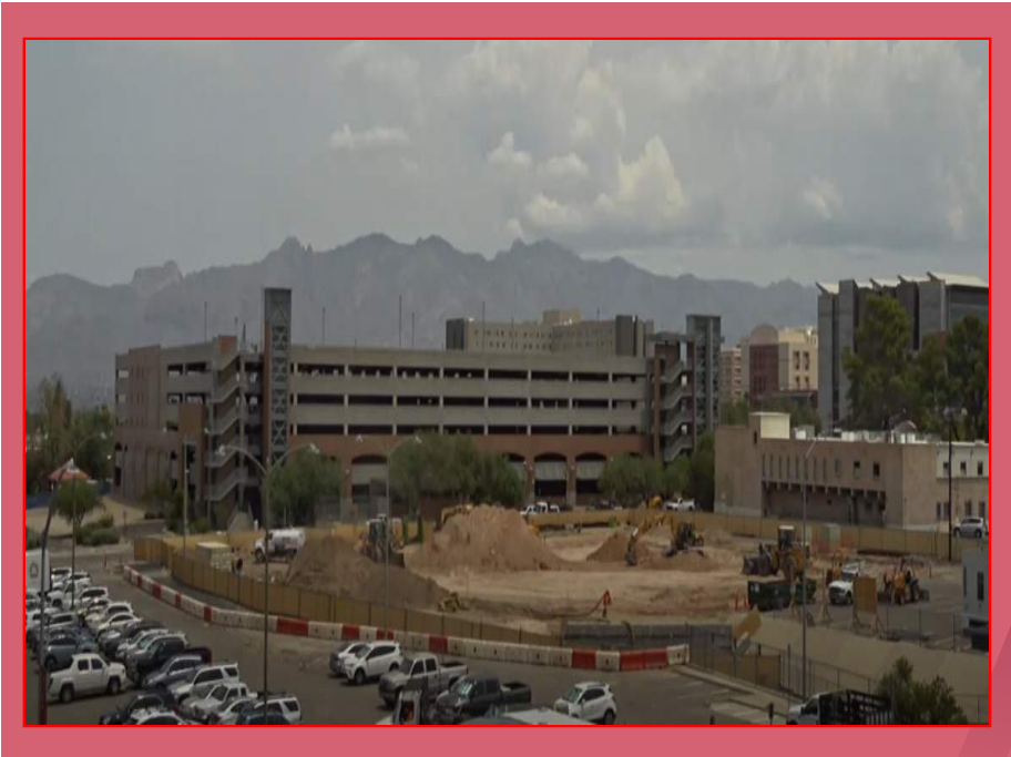
View looking north - Building progress