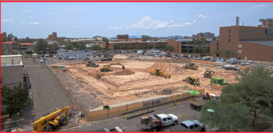
View looking south - Earthwork building progress