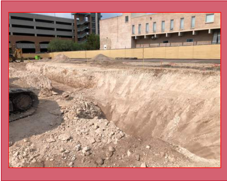
Main elevator pit excavation