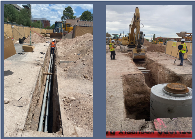
Helen Street Communications and Sewer Installation