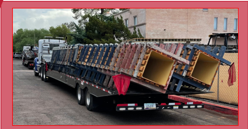
Column Formwork Onsite