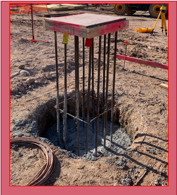
Caissons Caps Poured