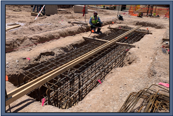
Grade Beam Reinforced and Ready for Concrete