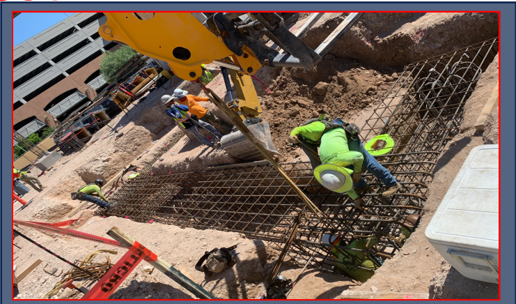
East grade beam reinforcing

Deep excavation completed for elevator 2 and stair 2.