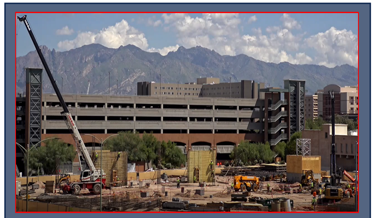
Jobsite camera facing north

The north shear-walls of the building are up and ready for concrete. Shear walls provide major structural support for the building concrete cast in place structure