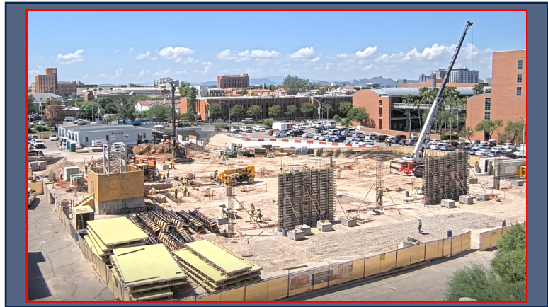
Jobsite camera facing south

The north shear-walls of the building are up and ready for concrete. Shear walls provide major structural support for the building concrete cast in place structure