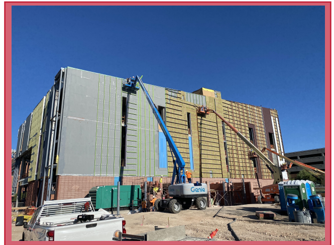
East side: insulation and preparation for metal panels