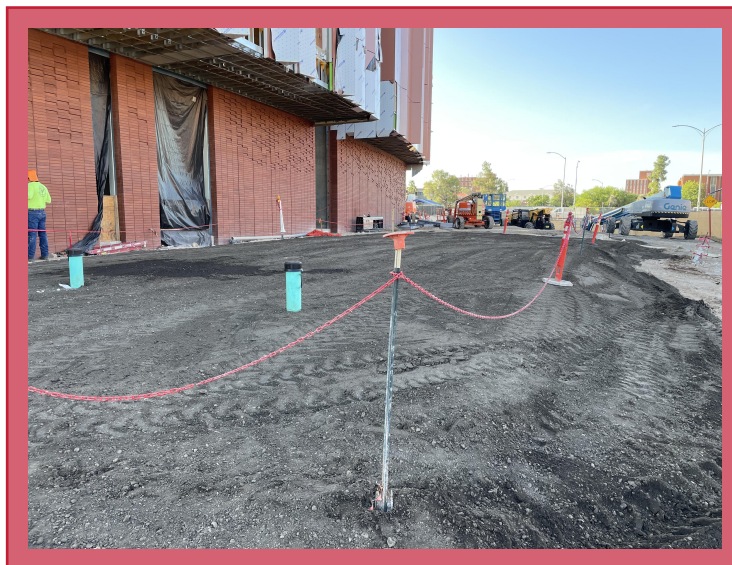
Tanks Backfilled and Protected