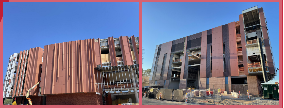
Metal panel systems progress on the West and North sides.

Starting next week, the crew will be installing metal panels on the East side and working their way toward the South side.