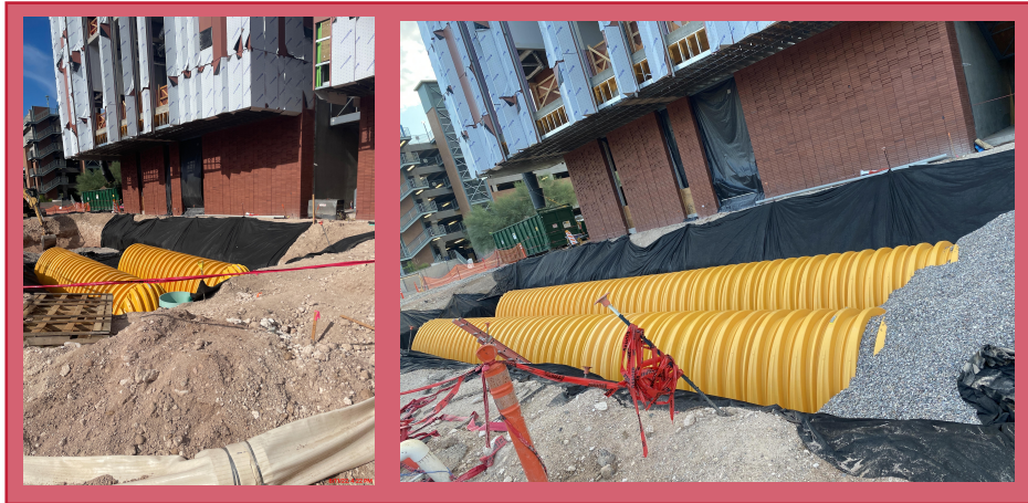
Installing the Tanks on NW Corner