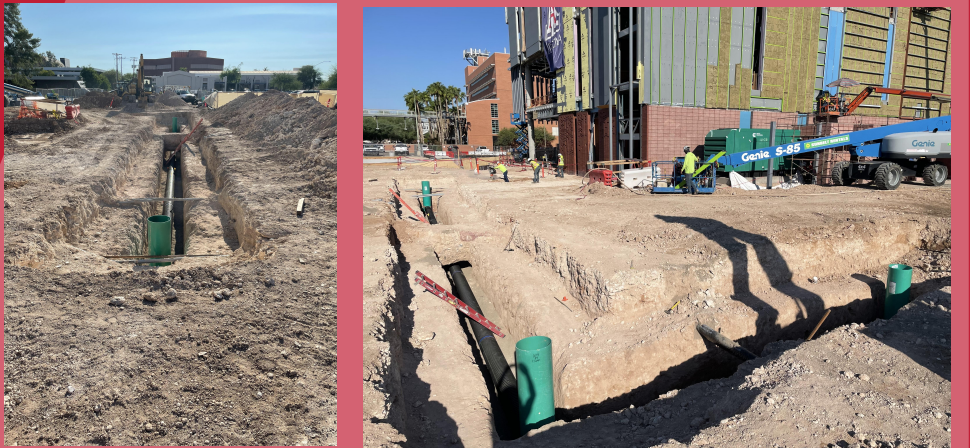
More storm water pipes are being installed at the South/Southeast sides of the building