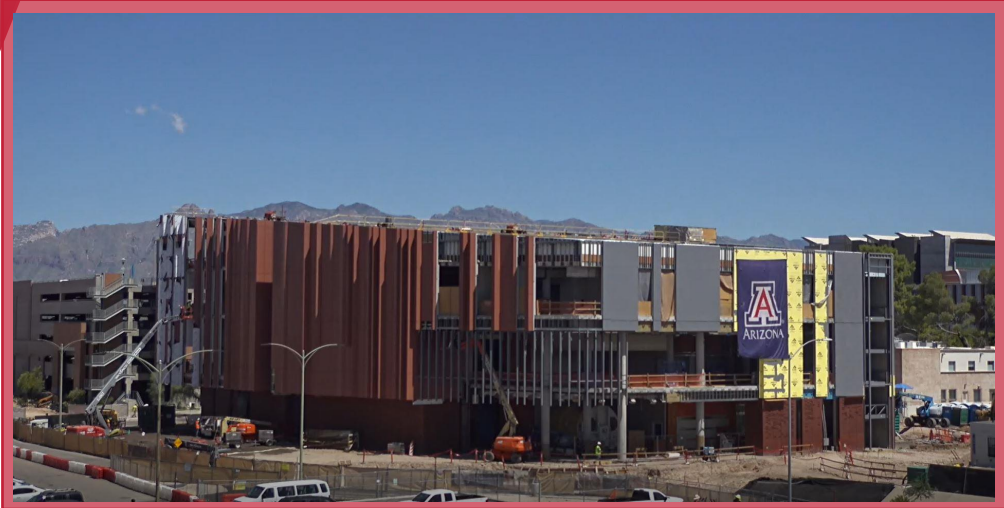
Facing North View