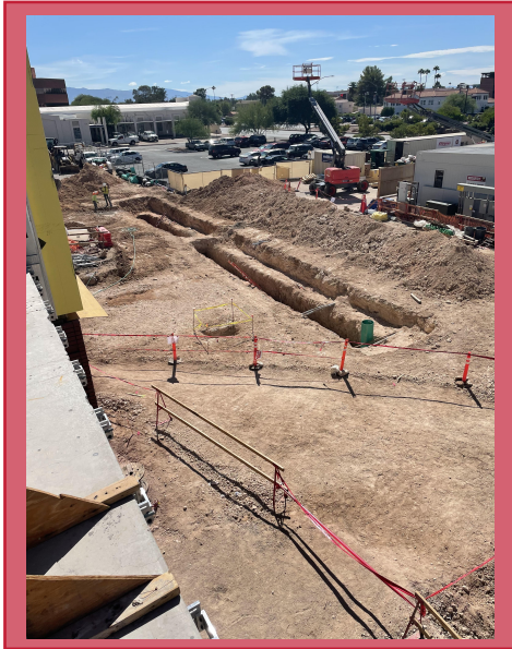
Site Excavations for Storm Water pipe that will connect into the underground storage tank system