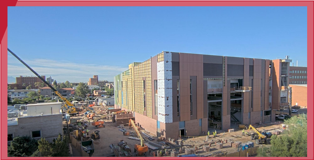
Facing South View