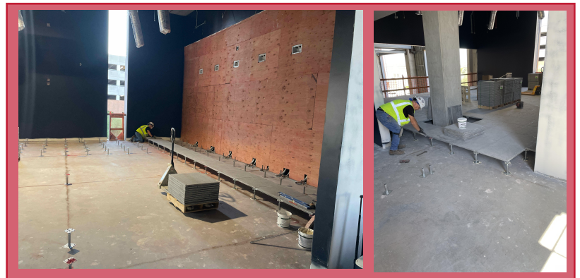
Raised Access Flooring