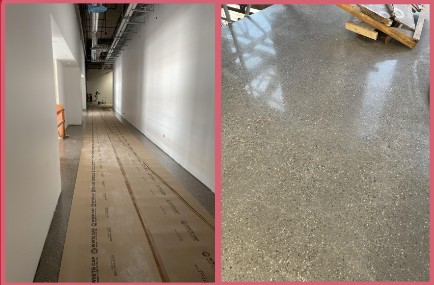
The brown board will protect the heavy grind finished floors to prevent damage during the remaining construction in these areas.