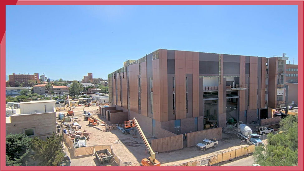
Facing South View