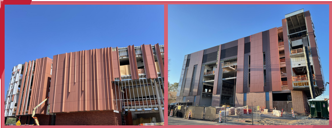
Metal panel systems progress on the West and North sides.