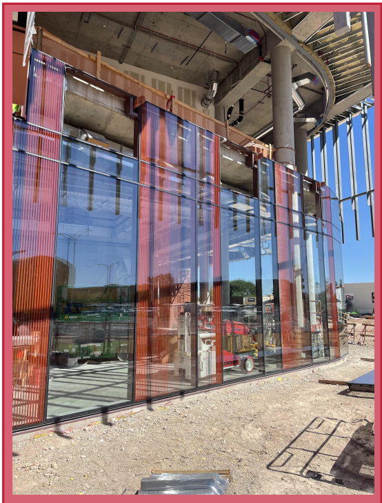
Storefront being installed on SW corner

Glass installation continues, crews will be ramping up next week and mobilizing a crane to install glass on the West side.