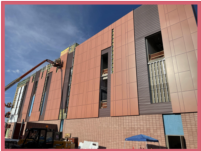
Metal panel progress on East side

Crews are ready to turn the corner and install the last of the skin on the South elevation!