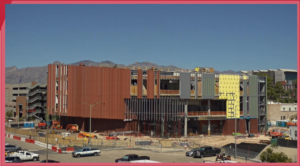
Facing North View