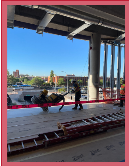
Grinding the exposed concrete floors on level 2

The Applied Research Building has many areas that are exposed concrete and receive a heavy grind. This heavy grind is close to 400-grit resin, which leaves a slight shine and reveals the rocks embedded in the concrete.