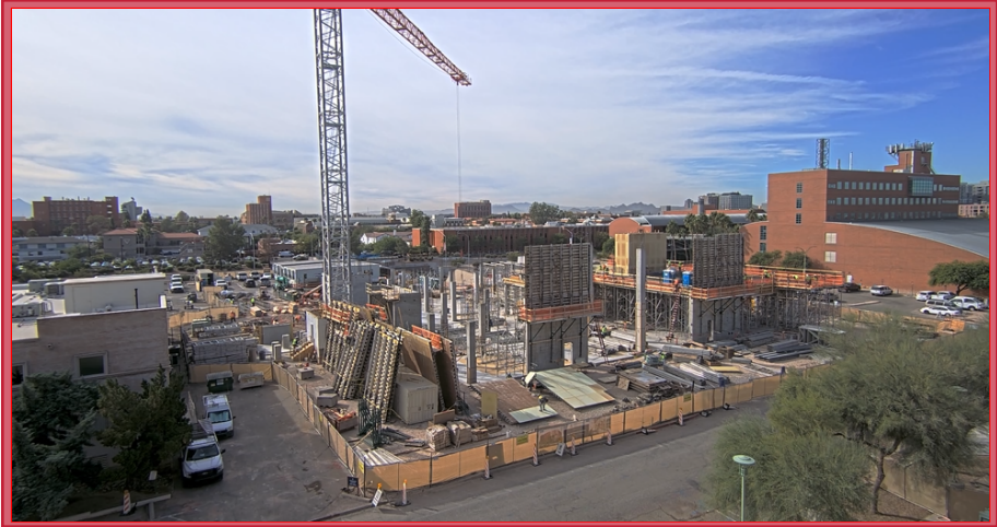
Facing South View