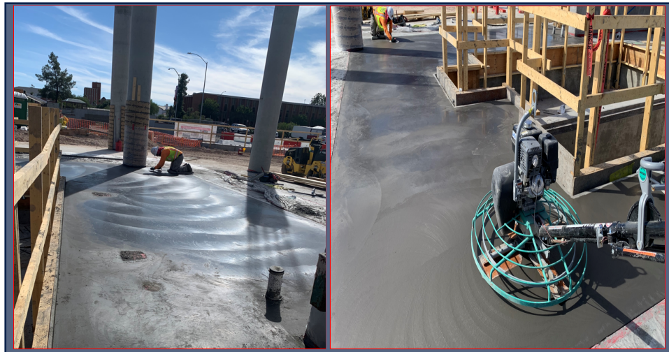
Integral Color Concrete Slab Poured (Stone Harbor Color)