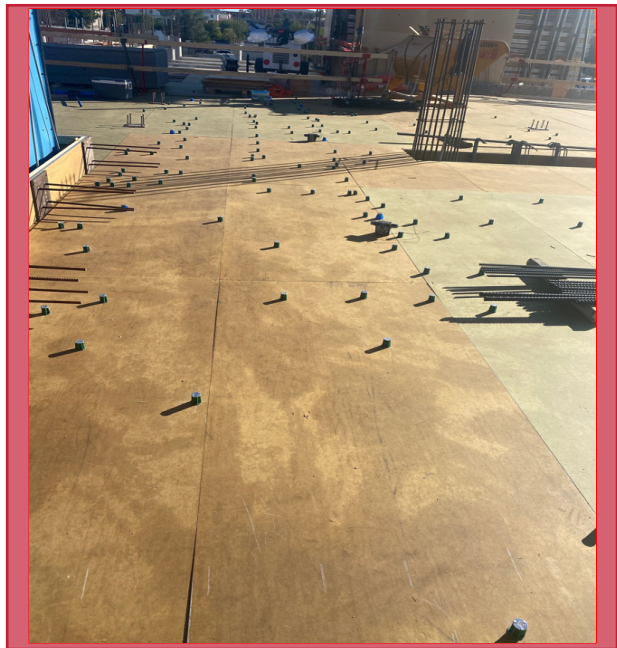
Level 2 MEP Deck Support Inserts Set

PHASE: Mechanical Electrical and Plumbing