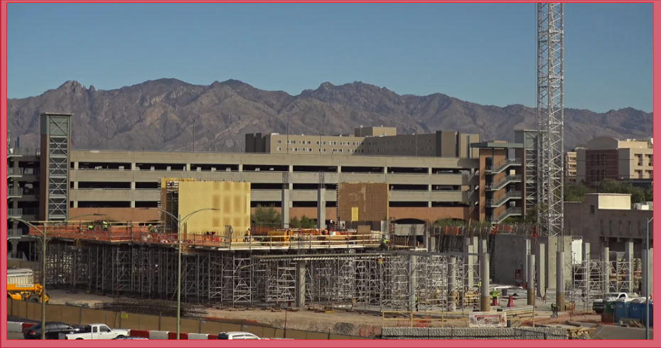
Facing North View