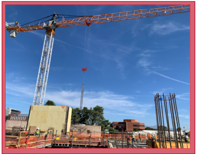
Flying Pre-Fab Steel Column