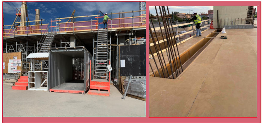
Level 2 West Decking Complete - Ready for Reinforcing