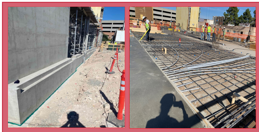
Water Proofing Of The Exterior Footings And Continued In Slab Electrical Conduits