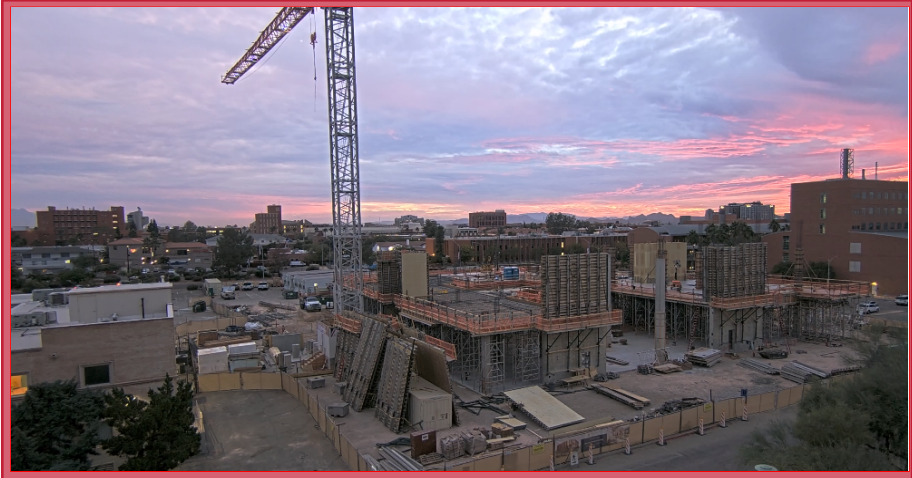
Facing South View