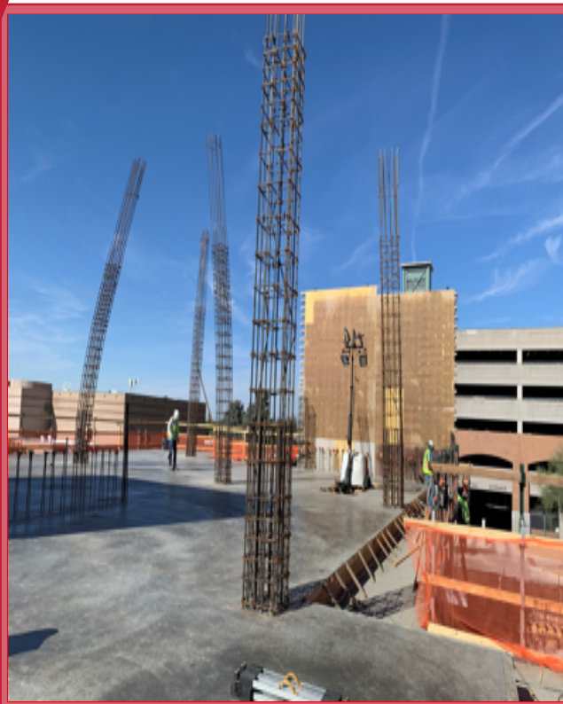
Setting Steel Columns On Level 2