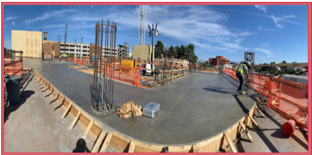
Level 2 Deck After Concrete Pour