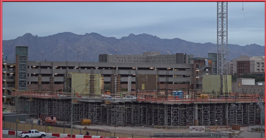
Facing North View