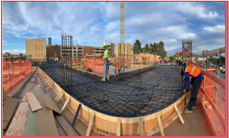
Level 2 Deck Reinforcing