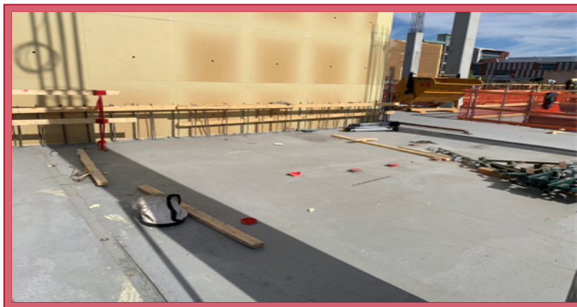
Depressed Floor Area for Level 2 Restroom

The square blockout next to the wall form in the top photo is a bathroom that will get tile flooring. Therefore, it has 2x4s to distinguish the finish level of that area to compensate for the tile construction build up. The bottom photo shows the depressed area after it's poured.