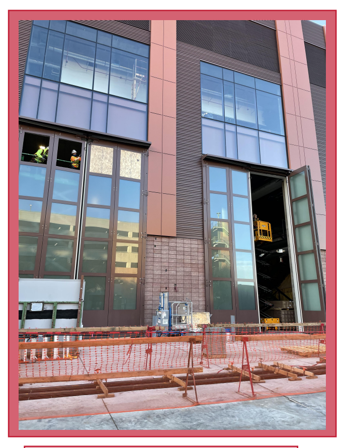
Exterior view of the bi-fold doors facing South