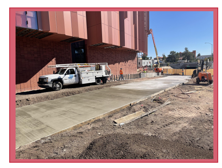
Freshly poured concrete for the North side of Highland Corridor

Fun Fact: Landscape and paving has started for the North side of the Highland Underpass Corridor. The NEW path will open early morning January 11th!