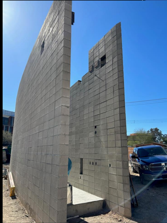
Meditation building: Masonry complete