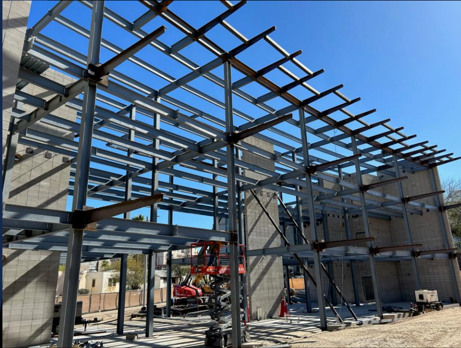
Office Building Area B & C: Steel erection progress