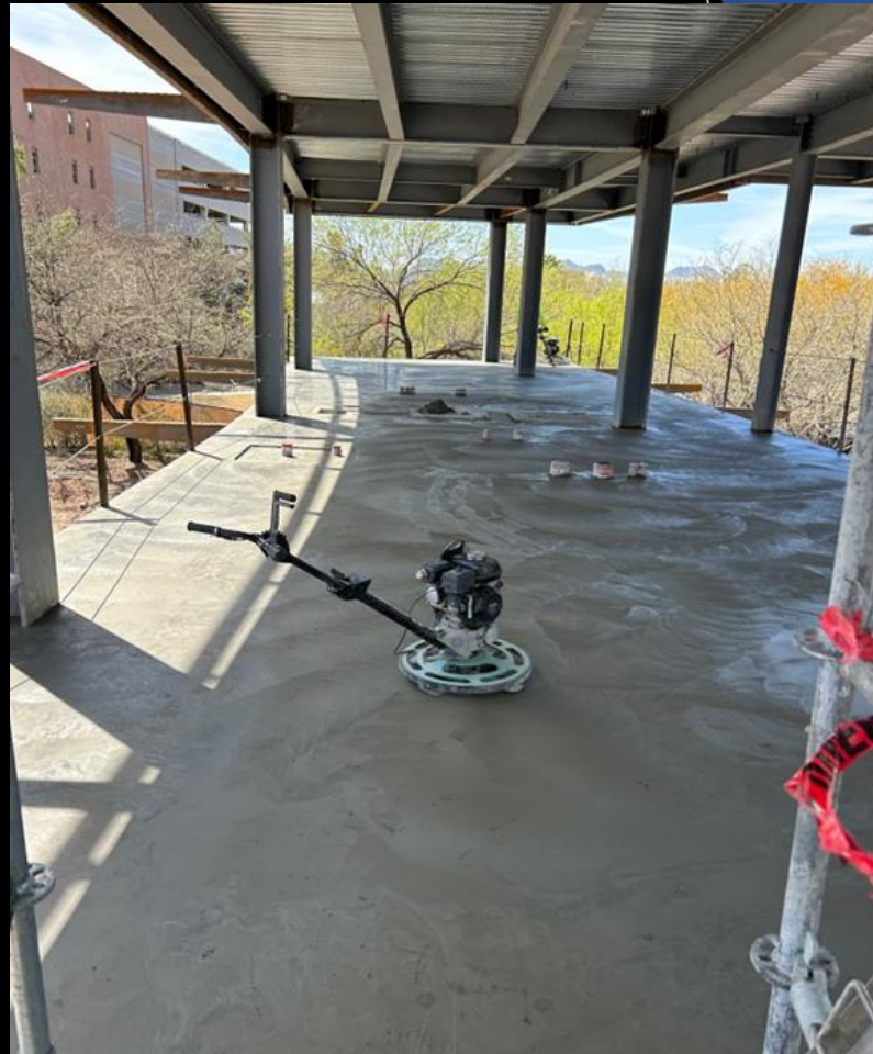
Office building Area A: Metal deck, rebar and concrete completed in level 2 & 3