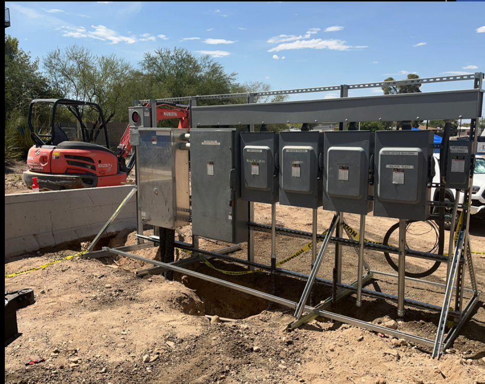
Electrical service for construction site's temporary power