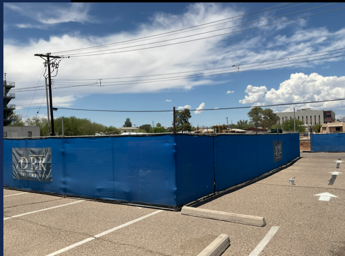
Construction Fence with Privacy Screen