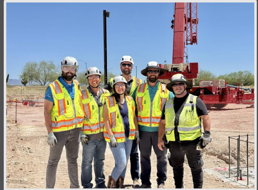
DPR team with the first column

One of the first big milestones on a new build project is the day you start going vertical. The steel erection began on 4/23 and is moving along at a steady pace.