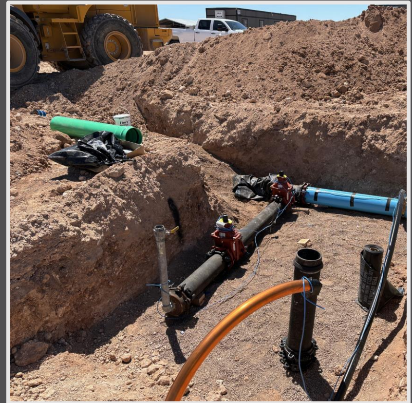
Fire Sprinkler and Domestic Water tie ins

This month we installed the new water main that is shown in blue on the site logistics plan. This includes the taps for the domestic water and fire sprinkler lines to the building.