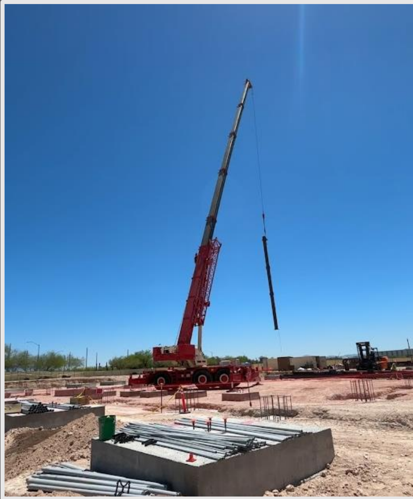
The first piece of steel going up